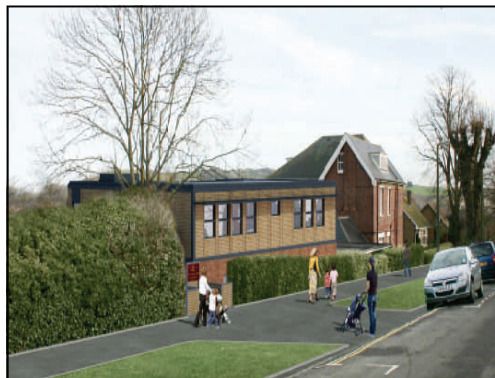
Image looking towards rear of building (from North East to South West)