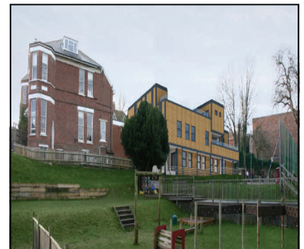
Image looking towards front of building (from West to East) along King Henry's Road