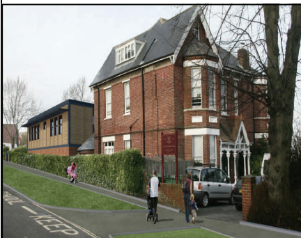
Image looking towards front of building (from East to West) along King Henry's Road